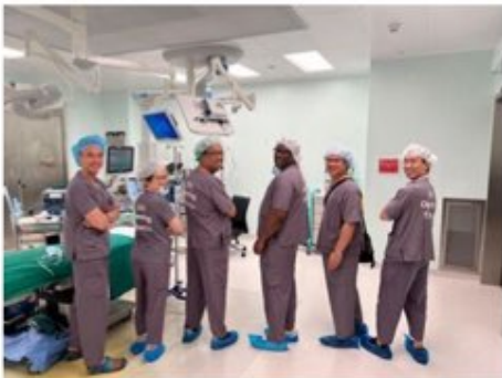
Operating theatre at Sengkang General Hospital