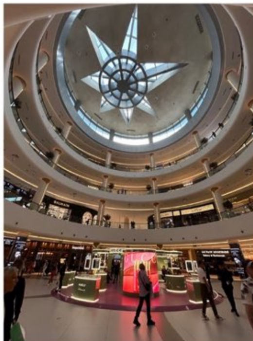
Dubai Mall, 2nd largest mall in the world

Overall I found the congress and Dubai experience valuable and