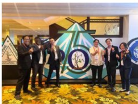
POA 75th annual congress

The following morning, we headed to Shangri La hotel, the venue for this year's Philippine Orthopaedic Association (POA) Annual Congress. We were very privileged to be able to attend, as this year represented the 75th anniversary of POA's annual congress. In keeping with their diamond jubilee celebration, the theme of this year's congress was Cutting Diamond: Looking Back, Moving Forward.