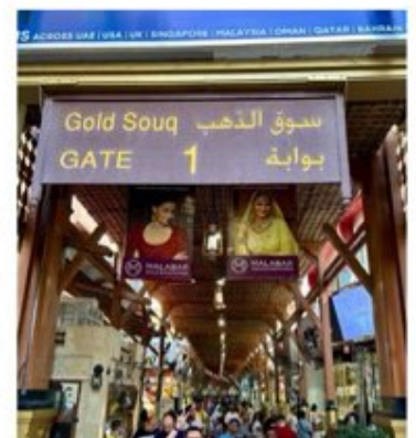
Gold Souk marketplace

enjoyable, and would recommend colleagues attend and present at future APOA congresses.