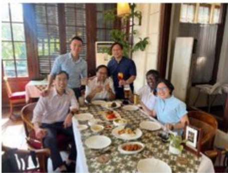
Lunch at Kafe Batavia in Kota Tua, Jakarta