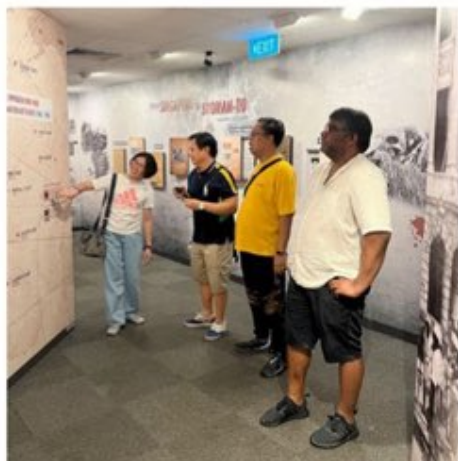
Examining the WWII exhibit at Fort Siloso

video documentary, complete with wax figures of Japanese & British soldiers at the Surrender Chamber – the Buddha Tooth Relic Temple and souvenir-shopping in Chinatown.