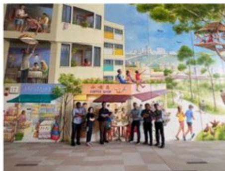
In front of the mural at Woodlands Health Campus

On the 9th of November, we visited the Woodlands Health Campus (WHC), a public hospital in Woodlands, Singapore, which consisted of both acute and community facilities.