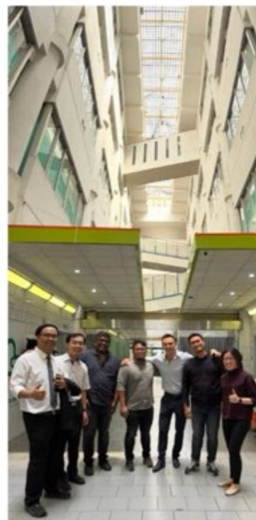
Emergency department of Dr. Soetomo General Hospital, with its Japanese-designed skylight & soaring staircases

We did our first fellowship hospital tour, visiting the inpatient surgical wards, emergency department and outpatient clinics. Here, we had the opportunity to engage with the local residents during their ward round and share what we would have considered doing in our own practice. This was a great opportunity for us to learn about how patients were treated in Surabaya.