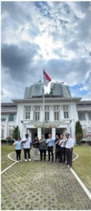
"Flying high" at the Faculty of Medicine, Universitas Indonesia