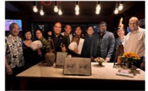
Receiving gifts of ties and pretty hand fans from AOA & SOA in Singapore