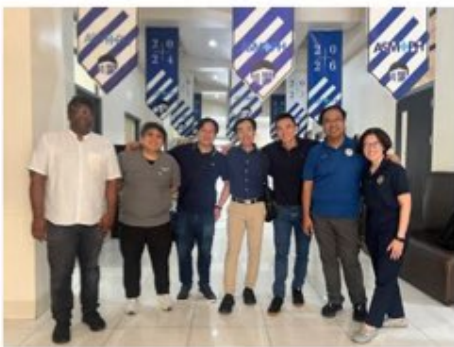
With one of the orthopaedic residents at (ASMPH)