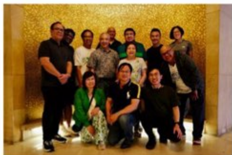
Dinner hosted by POA board members