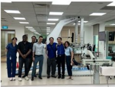
Physiotherapy centre at Sengkang General Hospital, with a robotic gait rehabilitation device in the background

We were then treated to lunch in one of the best-rated Chinese