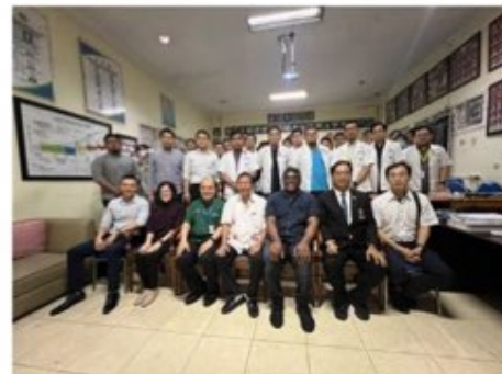
Morning orthopaedic meeting at Dr. Soetomo General Hospital

We did our first fellowship hospital tour, visiting the inpatient surgical wards, emergency department and outpatient clinics. Here, we had the opportunity to engage with the local residents during their ward round and share what we would have considered doing in our own practice. This was a great opportunity for us to learn about how patients were treated in Surabaya.