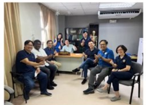
With the head of the department and orthopaedic residents at Quirino Memorial Medical