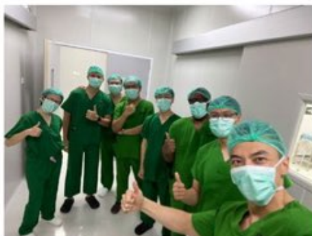
Operating theatre at Fatmawati Central General Hospital

We were subsequently brought around the designated orthopaedic centre of excellence, the newly-built operating complex. In the massive operating rooms, we were able to observe several hip cases and a tumour case, which made us quite 'at home', seeing as we were going to be missing work for the next few days!