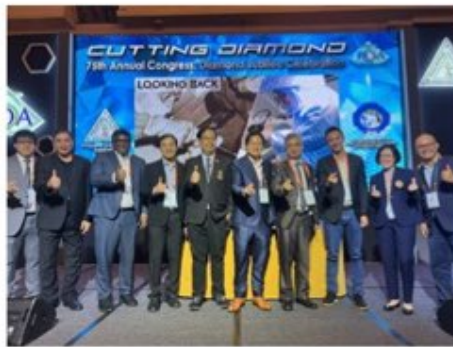
With the moderators of our oral presentation session at the POA annual congress

The night continued long into the morning with lots of tipsy impromptu karaoke hosted by Tinggoy to cement our fellowship of lasting friendship.