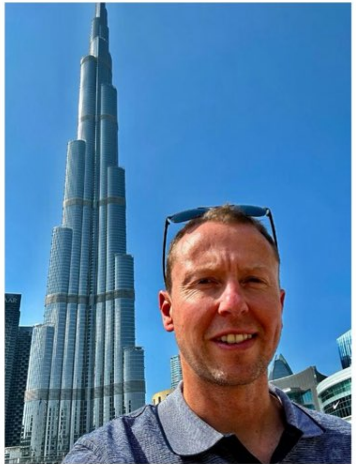
Burj Khalifa, tallest structure in the world

The social and cultural component of the congress was thoroughly enjoyable, particularly with the perfect weather in the low 20's. Long standing friendships