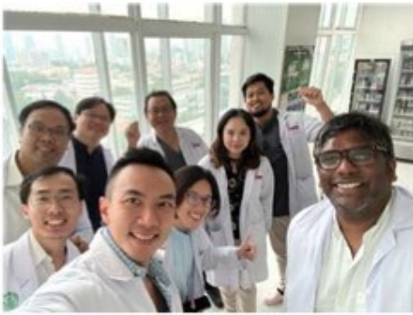
Visiting the stem cell laboratory in IMERI