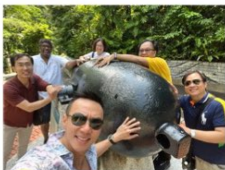
At Fort Siloso