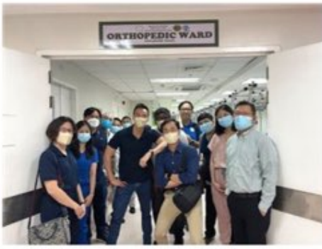
Visiting the orthopaedic ward at Quirino Memorial Medical Center